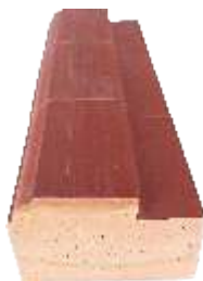
WPC DOOR FRAME