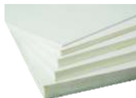
PVC FOAM BOARD